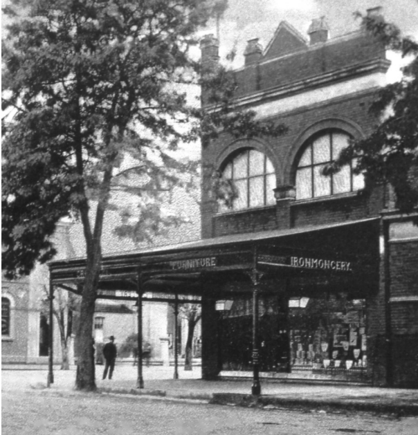
T H Mate & Co building before the fire in December 1915

In addition to the offices of the AMP, occupiers of the building include A A Hart (Blasbalk's) Jeweller and Messrs W D James & Co's Printing